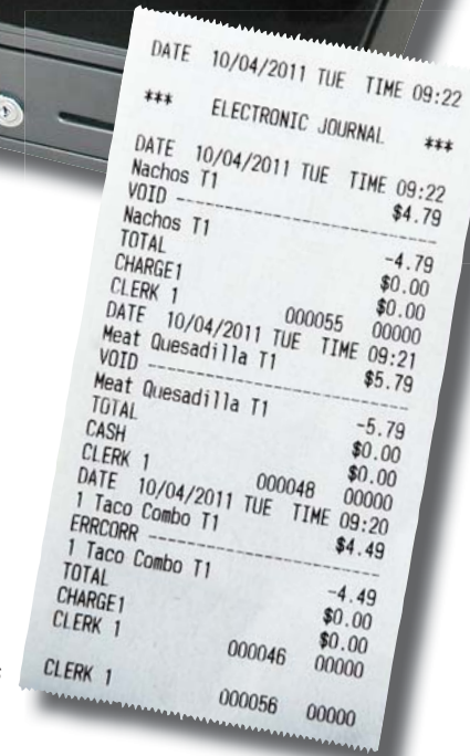
Electronic Journal Report sorting only voids shown 75% actual size.

The journal can be archived electronically for printing at end-of-day, or can be collected on an SD card. A variety of electronic journal options are available that allow you to quickly audit selected activities.